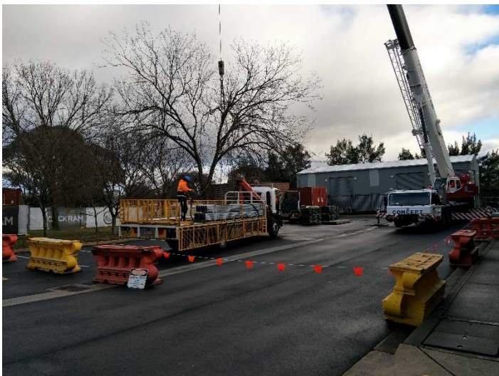
Progress photo of lifts being completed for roofing works

Remainder of site sheds to be delivered on Thursday 27/07 and power to be run to sheds on Monday 31/07. Roof works continuing as per schedule.