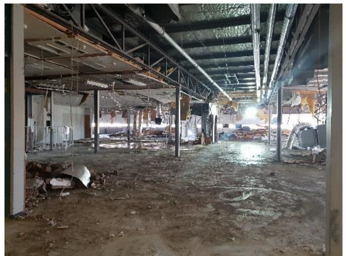
Demolition works underway in Stage 2