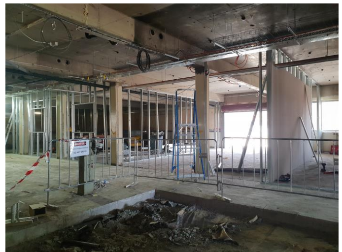
Stage 2 Internal demolition works nearing completion with install of wall framing underway.