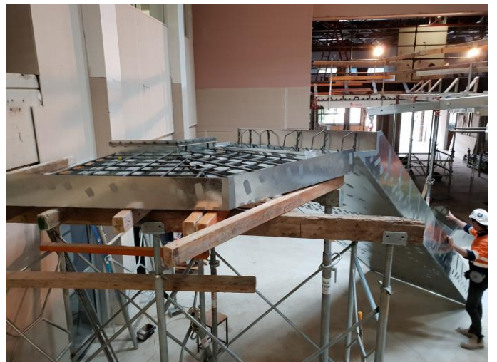
Stair 1 installation underway