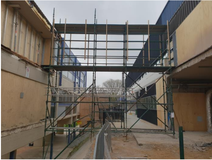
Temporary bridge installation underway