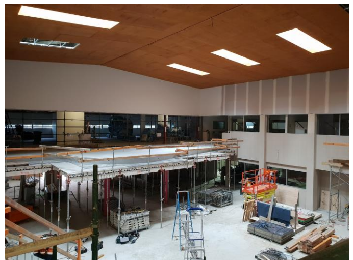
Internal courtyard works underway