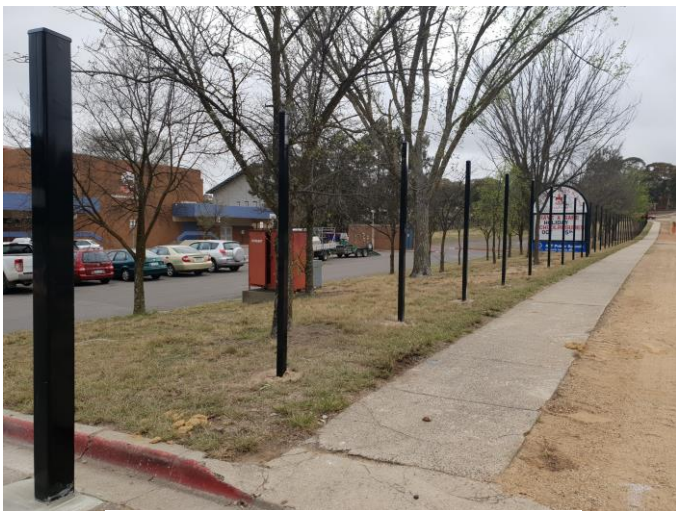
Installation of posts for perimeter fencing