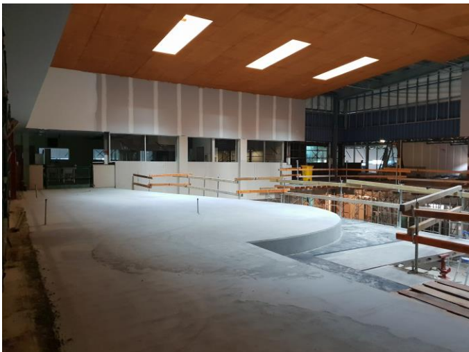
Concrete poured for curved overhang slab