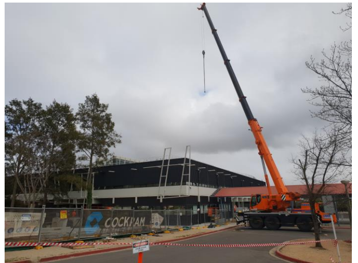
Installation of steel for façade screen continues