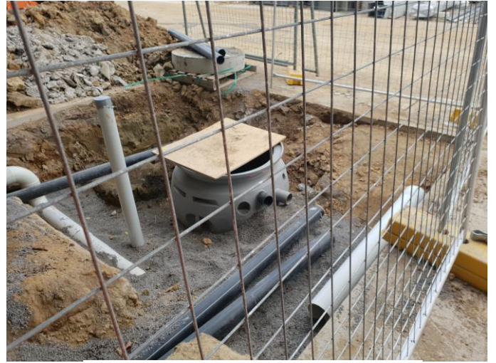
Grease Arrester installation completed