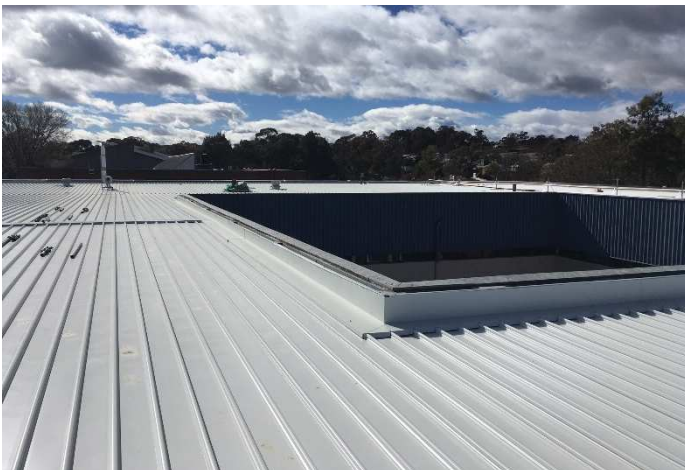
Progress photo of scaffold removed and parapet ready for flashing.

Roof works continuing as per schedule with the perimeter roof scaffold now removed and perimeter flashing continuing. The first stage of internal works will begin in the last week of September with CCA taking possession from the 23/09/17.