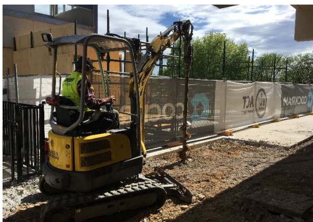
Excavator assisting with ground condition inspections.

CCA is continuing works throughout the first stage with demolition works to the main building to be completed mid-November. Services contractors continue to work with the demolition team as well as starting set-out for the new services. All hoardings (secure wall structures) will remain in place during construction and the temporary buildings are operational.