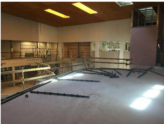
Curved overhang slab with scaffold being installed