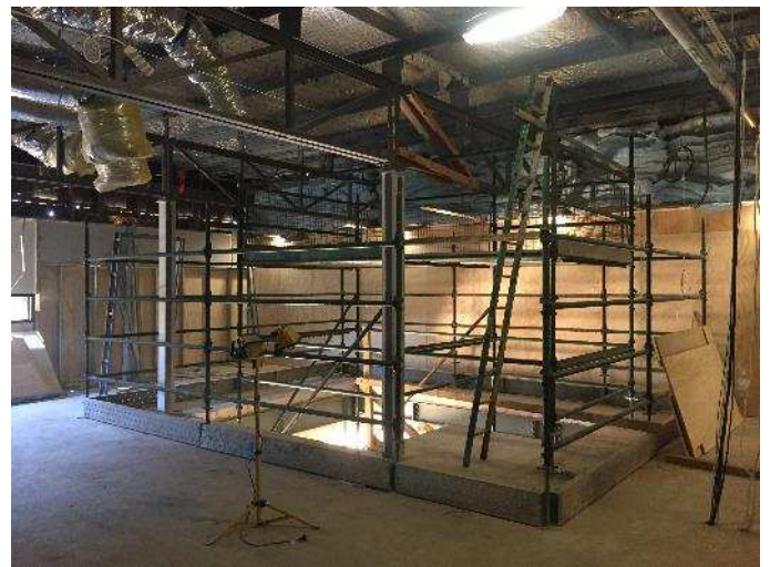
Stair 2 scaffolded in preparation for ceiling & partition works