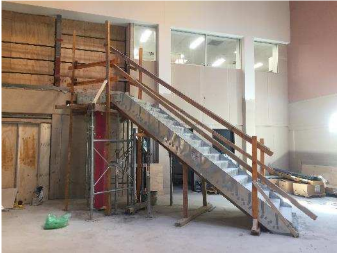
Stair 1 in the Learning Commons after pouring