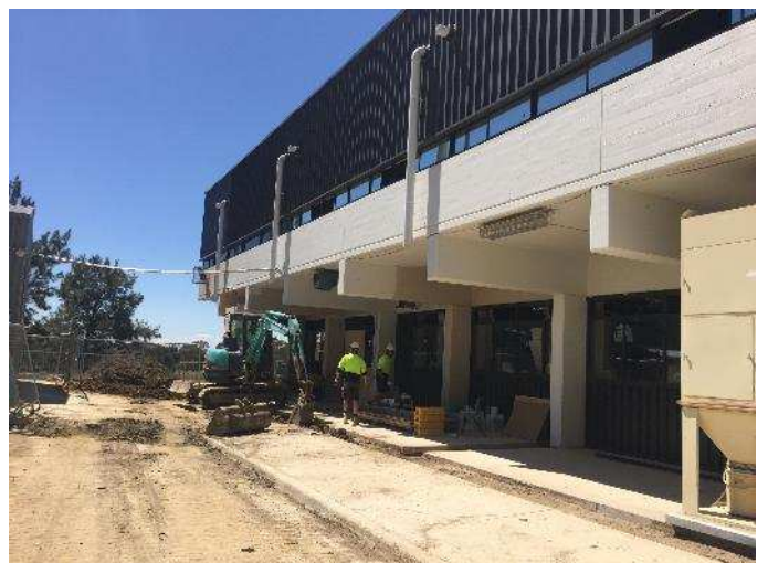
Excavation & install of stormwater drainage