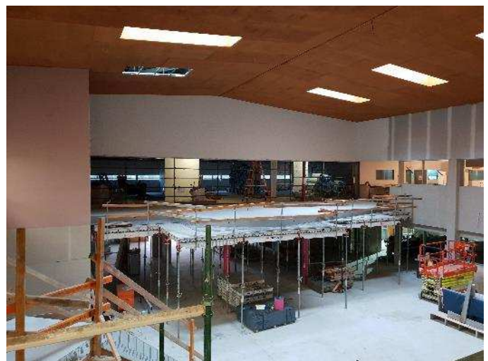
Internal courtyard works underway