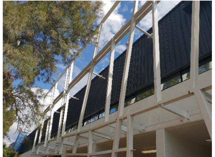
Structural steel works for façade screen underway