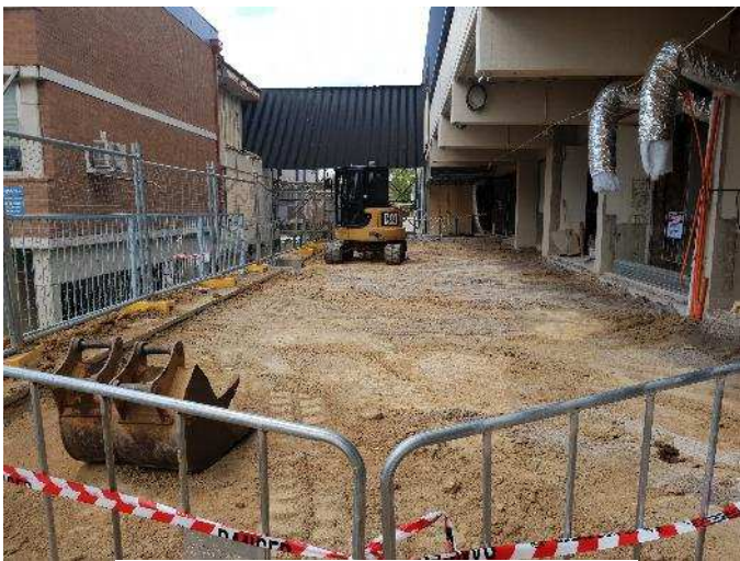
Slab preparation in the northern end