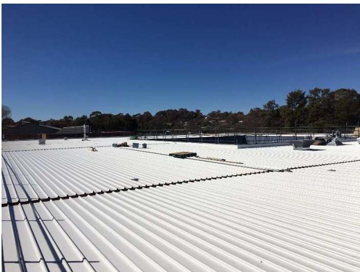
Progress photo of roof works.

Roof works continuing as per schedule with the permanent roof safety anchor system now installed and flashing continuing over the next two weeks. The final small sections of services relocation, insulation and sheeting is scheduled to be completed week ending 15/09/17.