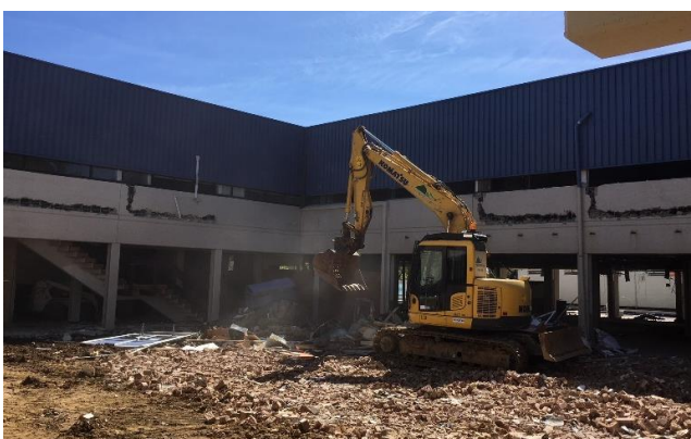
Excavator removing demolition material from the ground floor.

CCA is now in possession of site with the first stage of construction works underway. Service isolation has taken place and demolition works have commenced. Main demolition is currently underway on the Ground Floor with the Level 1 works to begin mid-next week. All hoardings (secure wall structures) are now installed and the temporary buildings are installed and operational.