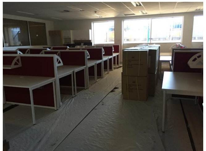
Joinery and furniture installation underway.