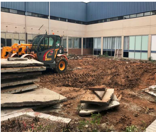
Current progress photo of completed courtyard works

A consultant has been engaged to conduct a full dilapidation inspection. This is scheduled to take place on Wednesday 19/07 commencing at 9:30am.