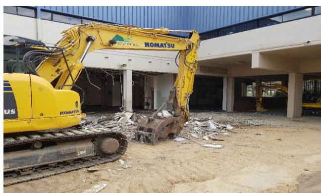
Excavator undertaking demolition works of the internal ground floor.

CCA has now taken possession of site for the first stage of construction works. Service isolation has taken place and demolition works has commenced. All hoardings (secure wall structures) are now installed and the temporary buildings are installed and operational for commencement of the new term.