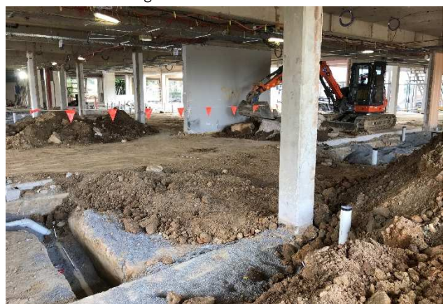
Excavation and backfill to allow for ground floor drainage