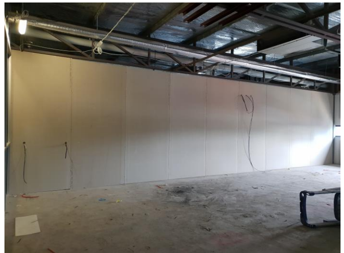
Wall framing and sheeting to Level 1 underway